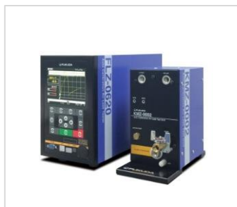
Air Leak Tester with Auto Calibrating Functionality