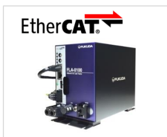
EtherCAT Compatible Air Leak Tester