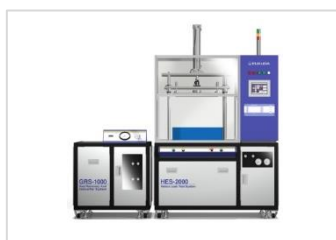
Helium Leak Test System