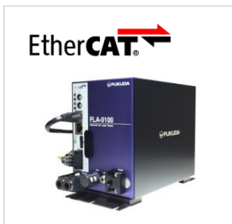
EtherCAT Compatible Air Leak Tester