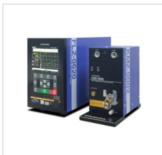
Air Leak Tester with Auto Calibrating Functionality